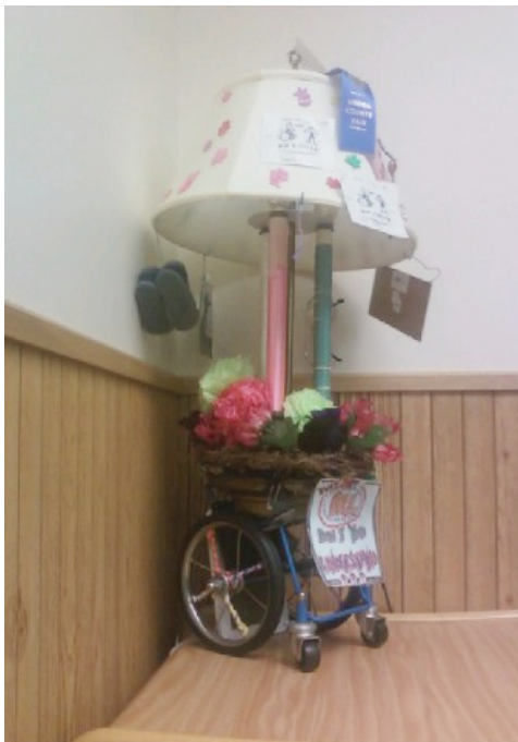
Blue Ribbon Winner

This summer the Day Services Program had a first – we entered the Ugliest Lamp Contest at the Oneida County Fair. The idea was originally pitched by a staff person and we immediately embraced the concept. A small group devised a plan to ensure awfulness – we bought the ugliest lamp we could find, enhanced it with unrelated, mismatched decorations and slogans to bring awareness to our on-going mission of inclusion. To top it off we added a wheelchair for effect. The final result -- Blue Ribbon!! Our “beautiful” lamp is on display in our meeting room for everyone to enjoy. Our lamp may have won “Ugliest”, but we think it's remarkable.