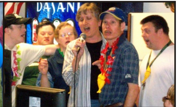
Group Karaoke fun