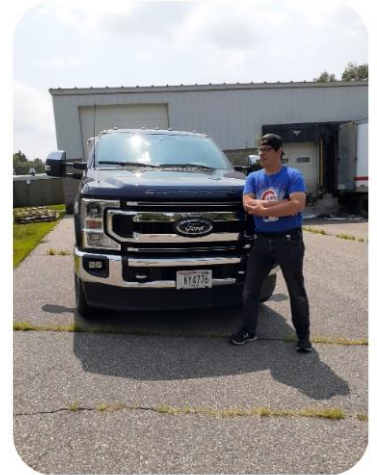
Headwaters purchased a new shredding truck in 2023 to assist with our shredding pick up service.